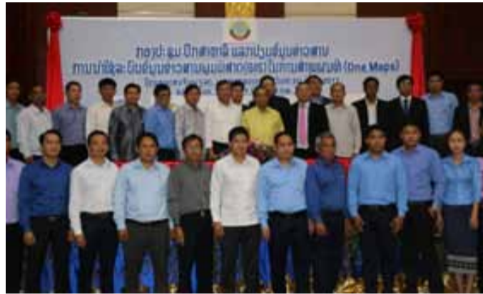
Participants join the meeting yesterday.

It also allows greater sharing and collaboration for government operation centres and clarifies administrative boundaries, transportation, hydrology, land parcels, forest boundaries and other topographic features.