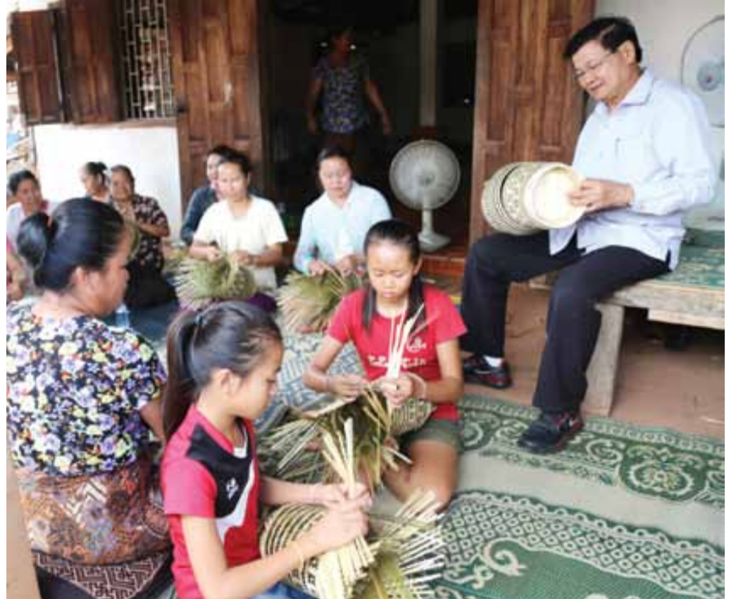
PM Thongloun examines a newly-finished woven rice basket at Nayang village, Phonhong district, Vientiane province yesterday.