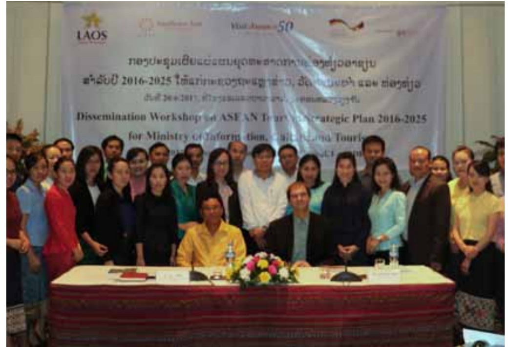
Tourism officials from the Ministry of Information, Culture and Tourism pose together at the meeting in Vientiane on Tuesday.