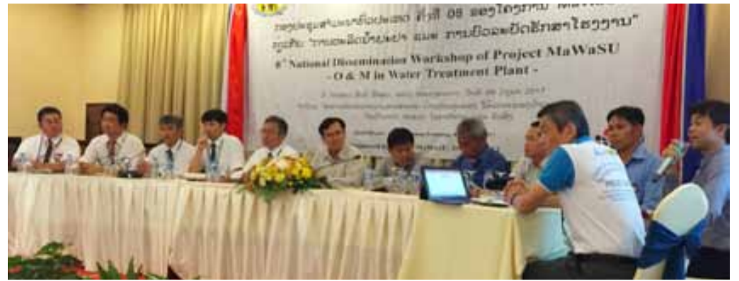
Lao and Japanese officials discuss the water supply sector.

During the meeting Lao and Japanese officials heard about ecological purification systems such as rapid sand filtration treatment and membrane filtration treatment which have been found to be